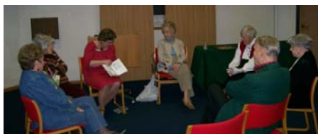
The Friends of the Library shared their favorite Christmas stories at a Tea and Cookies get-together.

The Friends of the library celebrated the holiday season this year with a tea and cookies get-together in the Holland meeting room. Members all brought their favorite Christmas stories to share, and everyone left in a holiday mood.