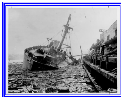
Above: The ruined Wilson B. Keene listing badly in Main Slip after the 1947 explosions of the Texas City Disaster.

Photographs may be searched by various categories and are viewable in enlarged format.