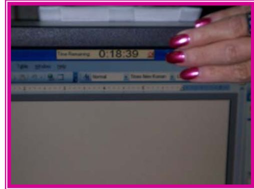
Above: The new time-out software displays how much time a user has remaining.

Patron reaction has been mainly positive about the management software because it helps users manage their time and prioritize Internet searching.