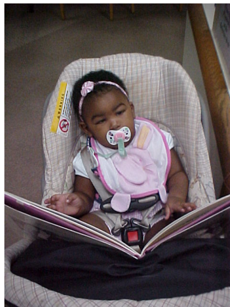
Above: One of Moore Memorial Public Library's littlest readers enjoys a book while her parents use the Internet.