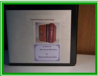
Above: CD ROMs compiled by the Huguenot Society of Great Britain and Ireland.

Moore Memorial Public Library now has extensive genealogical information on Huguenot families, thanks to a generous gift from a local genealogical organization. The Texas City Ancestry Searchers has graciously donated 12 CD-