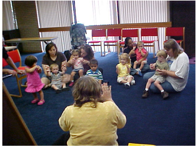
Above: Toddlers and their grownups enjoy Toddlerific Story Time

For more information, please call (409) 643-5966.